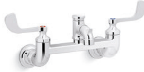
Wall-mount faucet with pail hook and wristblade handles