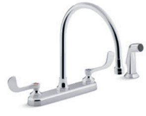
Kitchen sink faucet with gooseneck spout, wristblade handles and sidespray

1.5 gpm aerated K-810T71-4AHA 1.8 gpm aerated K-810T71-4AFA