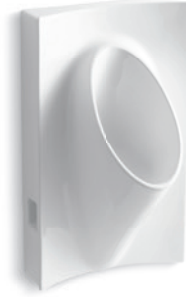
Steward L Wall-mount waterless urinal