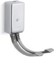
Foot control Double wall-mount