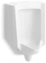
Bardon Wall-mount urinal

K-2590 0.125–1.0 gpf rear spud (shown) K-4991-ER 0.125–1.0 gpf top spud K-4991-ET