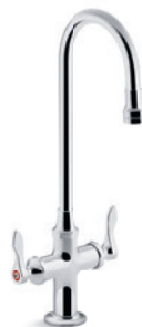
Monoblock lavatory faucet with gooseneck spout and lever handles

0.5 gpm aerated K-100T70-4ANA 0.5 gpm laminar K-100T70-4ANL 1.0 gpm aerated K-100T70-4AKA 1.0 gpm laminar K-100T70-4AKL