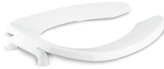
Lustra™ Open-front with check hinge