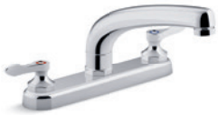
Kitchen sink faucet with low spout and lever handles

1.5 gpm aerated K-810T20-4AHA 1.8 gpm aerated K-810T20-4AFA