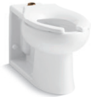
Anglesey Elongated with rear outlet and angle back

1.6 gpf top spud (shown) K-4386 1.6 gpf rear spud K-4396