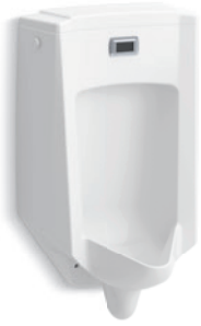
Bardon™ Touchless Wall-mount urinal

0.125 gpf top spud (shown) K-5244-ET 0.125 gpf rear spud K-5244-ER