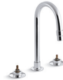
Widespread lavatory faucet base with gooseneck spout