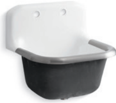
Bannon™ Wall-mount service sink with rim guard

Two faucet holes (shown) K-12787 Single drilling K-12781 / K-12784