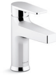
Taut single-handle lavatory faucet