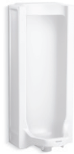
Darfield™ Wall-mount urinal