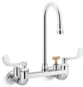
Wall-mount faucet with gooseneck spout, wristblade handles and loose-key stops