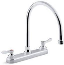
Kitchen sink faucet with gooseneck spout and lever handles

1.5 gpm aerated K-810T21-5AHA 1.8 gpm aerated K-810T21-5AFA