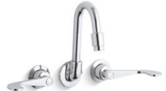
Triton shelf-back lavatory faucet with wristblade handles