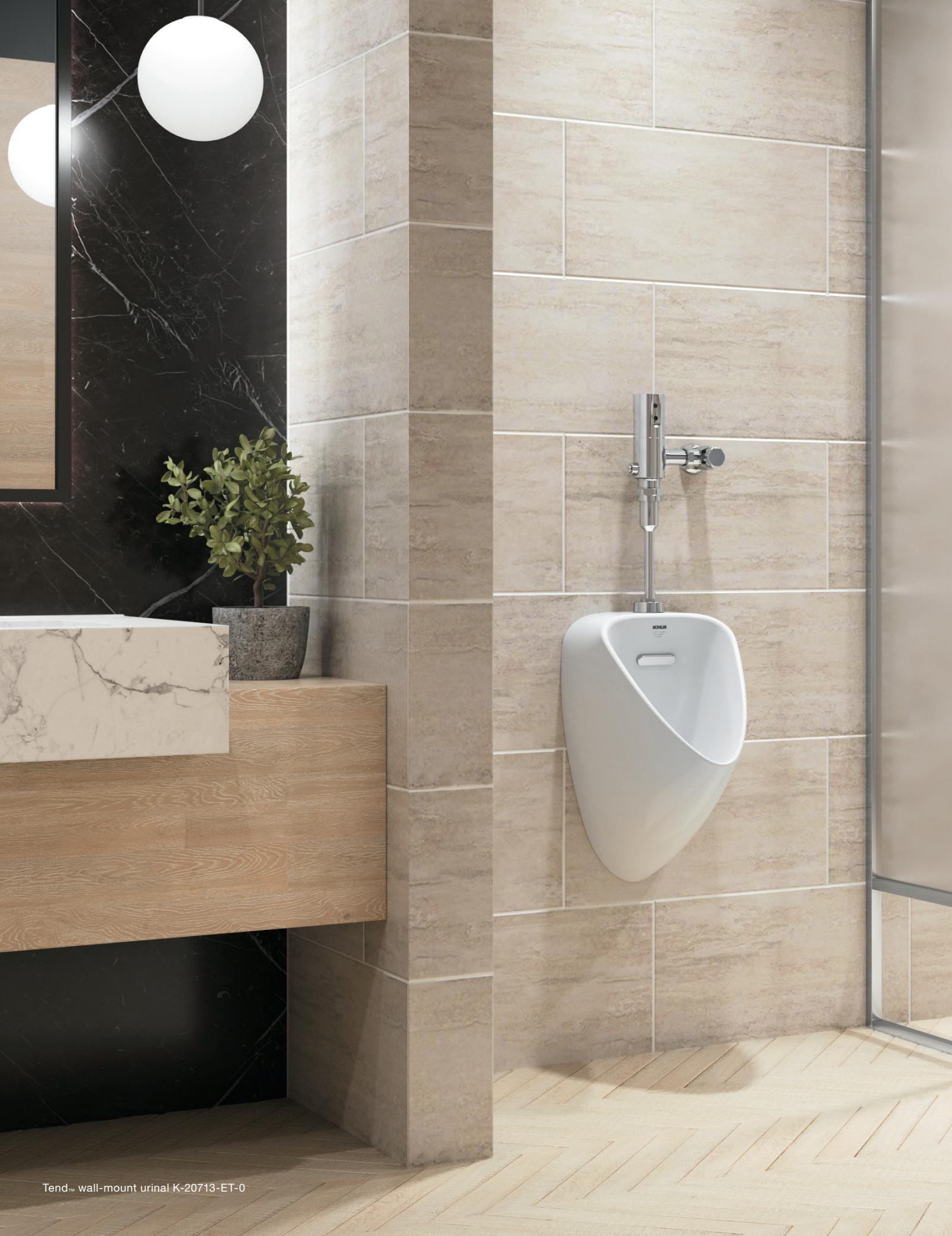
Tend™ wall-mount urinal K-20713-ET-0