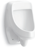
NEW Tend™ Wall-mount urinal

0.125-1.0 gpf rear spud K-20713-ER* 0.125-1.0 gpf top spud (shown) K-20713-ET*