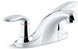
Coralais two-handle centerset lavatory faucet