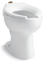
Highcliff™ Ultra Comfort Height® Elongated

1.1–1.6 gpf top spud (shown) K-96053 1.28–1.6 gpf rear spud K-96054