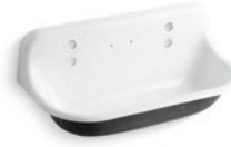
Brockway™ Wall-mount wash sink

Two faucet holes (shown) K-6714 / K-6716 No drilling K-6718 / K-6719