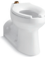
Anglesey™ Comfort Height Elongated with rear outlet