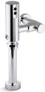
Tripoint touchless toilet flushometer

Kohler offers two unique types of touchless activation. WAVE technology offers hygienic on-command activation when the hand is waved directly over the flushometer. It eliminates random flushing that can be frightening to children—while also conserving water. Tripoint® technology senses the true distance of an object, is not affected by changes in light, reflection or distant movement and delivers precise performance. The KOHLER Hybrid energy system, which combines low-energy draw with high-energy storage, powers flushometers delivering 30 years of power.*