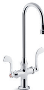
Monoblock lavatory faucet with gooseneck spout and wristblade handles

0.5 gpm aerated K-100T70-4ANA 0.5 gpm laminar K-100T70-4ANL 1.0 gpm aerated K-100T70-4AKA 1.0 gpm laminar K-100T70-4AKL