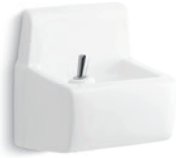
Millbrook™ Wall-mount drinking fountain