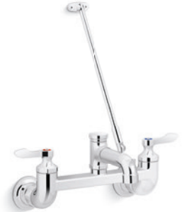
Wall-mount faucet with pail hook, wall brace and lever handles