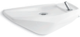
Serra™ Wall-mount drinking fountain