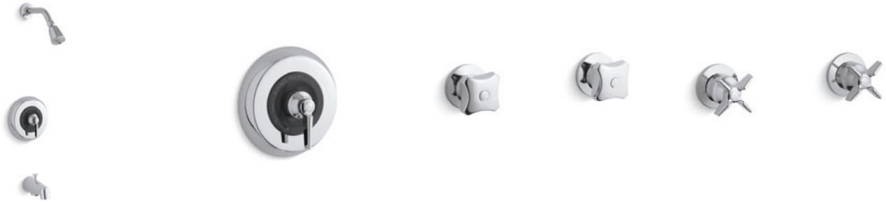
Triton® Rite-Temp® pressure-balancing bath/shower trim set

Lever handle (shown) K-TS6908-4 Standard handle K-TS6908-2