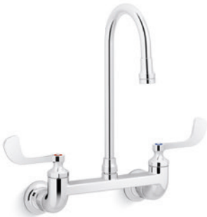
Wall-mount faucet with gooseneck spout and wristblade handles