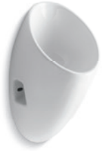
Steward® S Wall-mount waterless urinal