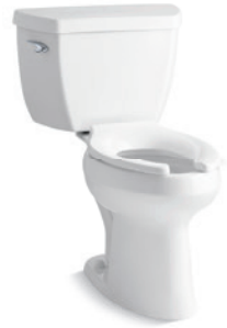
Highline® Classic Comfort Height Elongated with Pressure Lite technology

1.28 gpf comfort height elongated K-25077 1.28 gpf elongated (shown) K-25087 1.28 gpf round-front K-25097