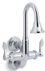
Wall-mount lavatory faucet with gooseneck spout, lever handles and rose spray

0.5 gpm aerated K-800T70-5ANA 0.5 gpm laminar K-800T70-5ANL 1.0 gpm aerated K-800T70-5AKA 1.0 gpm laminar K-800T70-5AKL