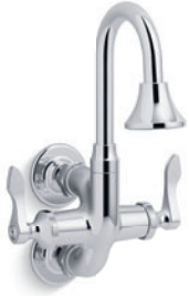
Wall-mount faucet with gooseneck spout, lever handles and rose spray