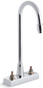
Centerset lavatory faucet base with gooseneck spout