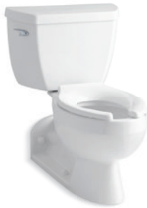
Barrington Elongated with rear outlet and Pressure Lite technology