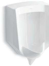
Stanwell™ Wall-mount urinal

K-2590 0.125–1.0 gpf rear spud (shown) K-4991-ER 0.125–1.0 gpf top spud K-4991-ET