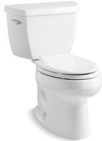
Wellworth® Classic Elongated with Pressure Lite technology