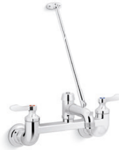
Wall-mount faucet with pail hook, vacuum breaker, threaded spout, wall brace and lever handles