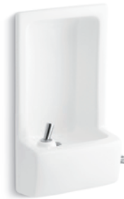
Glenbrook™ Semirecessed drinking fountain