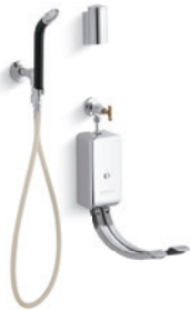
Bedpan washer With double foot control