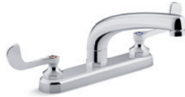
Kitchen sink faucet with low spout and wristblade handles

1.5 gpm aerated K-810T20-4AHA 1.8 gpm aerated K-810T20-4AFA