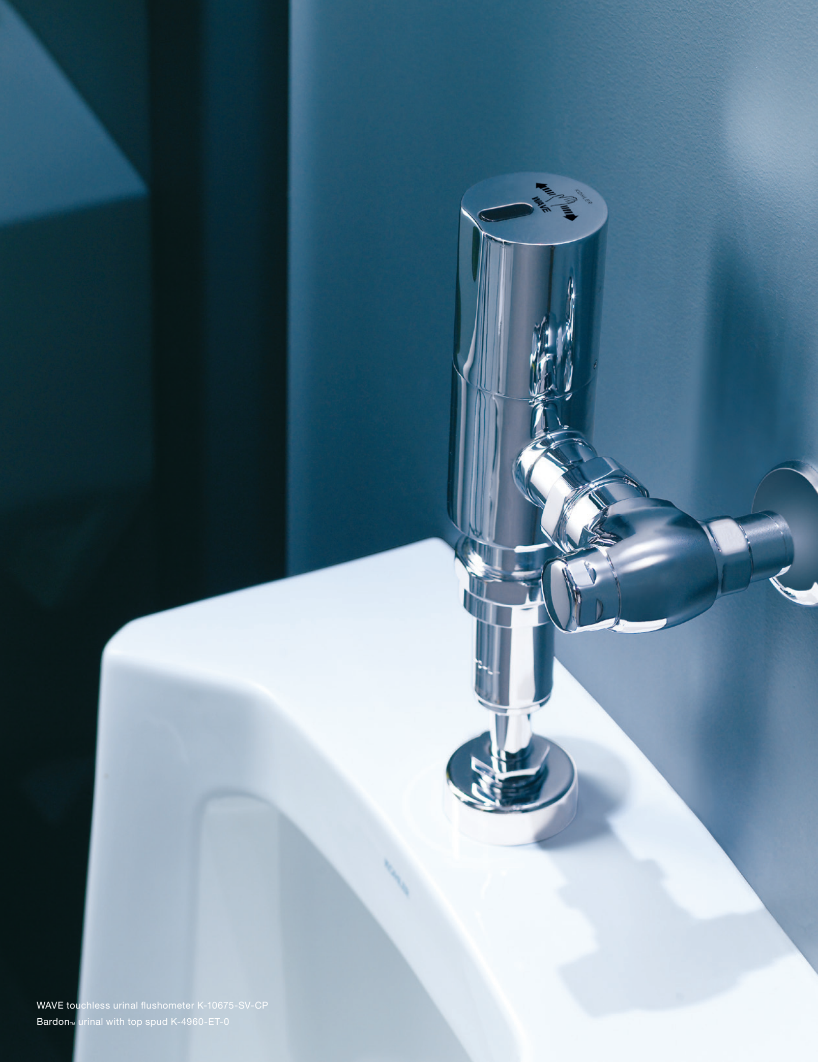
WAVE touchless urinal flushometer K-10675-SV-CP Bardon™ urinal with top spud K-4960-ET-0