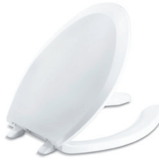
Lustra Elongated with seat cover