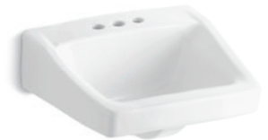
Brenham™ Wall-mount lavatory