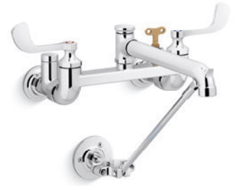
Wall-mount faucet with pail hook, wall brace, wristblade handles and loose-key stops