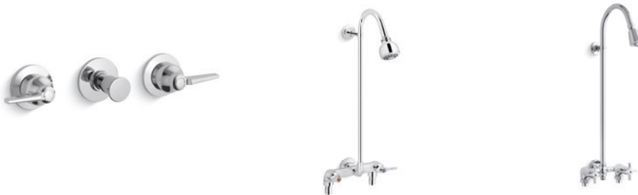
Triton Wall-mount cross handle trim with push-button diverter