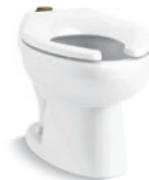
Juvenile™ Ultra Elongated; sized for kindergarten–grade 3