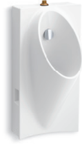
Steward Hybrid Wall-mount urinal

0.125 gpf top spud (shown) K-5244-ET 0.125 gpf rear spud K-5244-ER