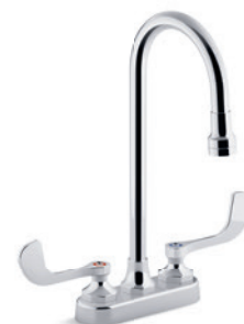
Centerset lavatory faucet with gooseneck spout and wristblade handles

0.5 gpm aerated K-400T70-4ANA 0.5 gpm laminar K-400T70-4ANL 1.0 gpm aerated K-400T70-4AKA 1.0 gpm laminar K-400T70-4AKL