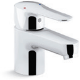
July single-handle lavatory faucet