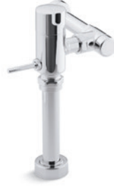
Primme® manual toilet flushometer