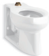
Anglesey With Integral Seat* Elongated with integral seat

Top spud K-25042-SS Top spud, bed pan lugs K-25042-SSL Rear spud K-25044-SS Rear spud, bed pan lugs K-25044-SSL