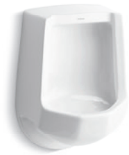
Freshman™ Wall-mount urinal

0.5–1.0 gpf top spud (shown) K-25048-ET 0.5–1.0 gpf rear spud K-25048-ER