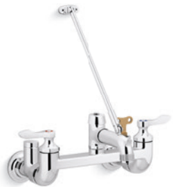
Wall-mount faucet with pail hook, vacuum breaker, threaded spout, wall brace, lever handles and loose-key stops