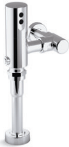
Tripoint touchless urinal flushometer

K-7521/K-10673-SV K-7523/K-10674-SV K-7559