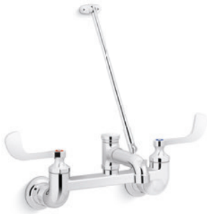
Wall-mount faucet with pail hook, wall brace and wristblade handles