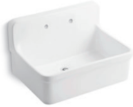
Gilford™ Wall-mount service sink

Two faucet holes (shown) K-12787 Single drilling K-12781 / K-12784