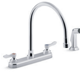
Kitchen sink faucet with gooseneck spout, lever handles and sidespray

1.5 gpm aerated K-810T70-5AHA 1.8 gpm aerated K-810T70-5AFA