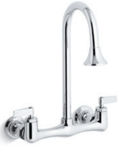
Triton® sink faucet with lever handles