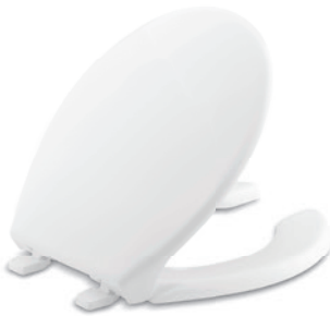
Lustra Round-front with seat cover