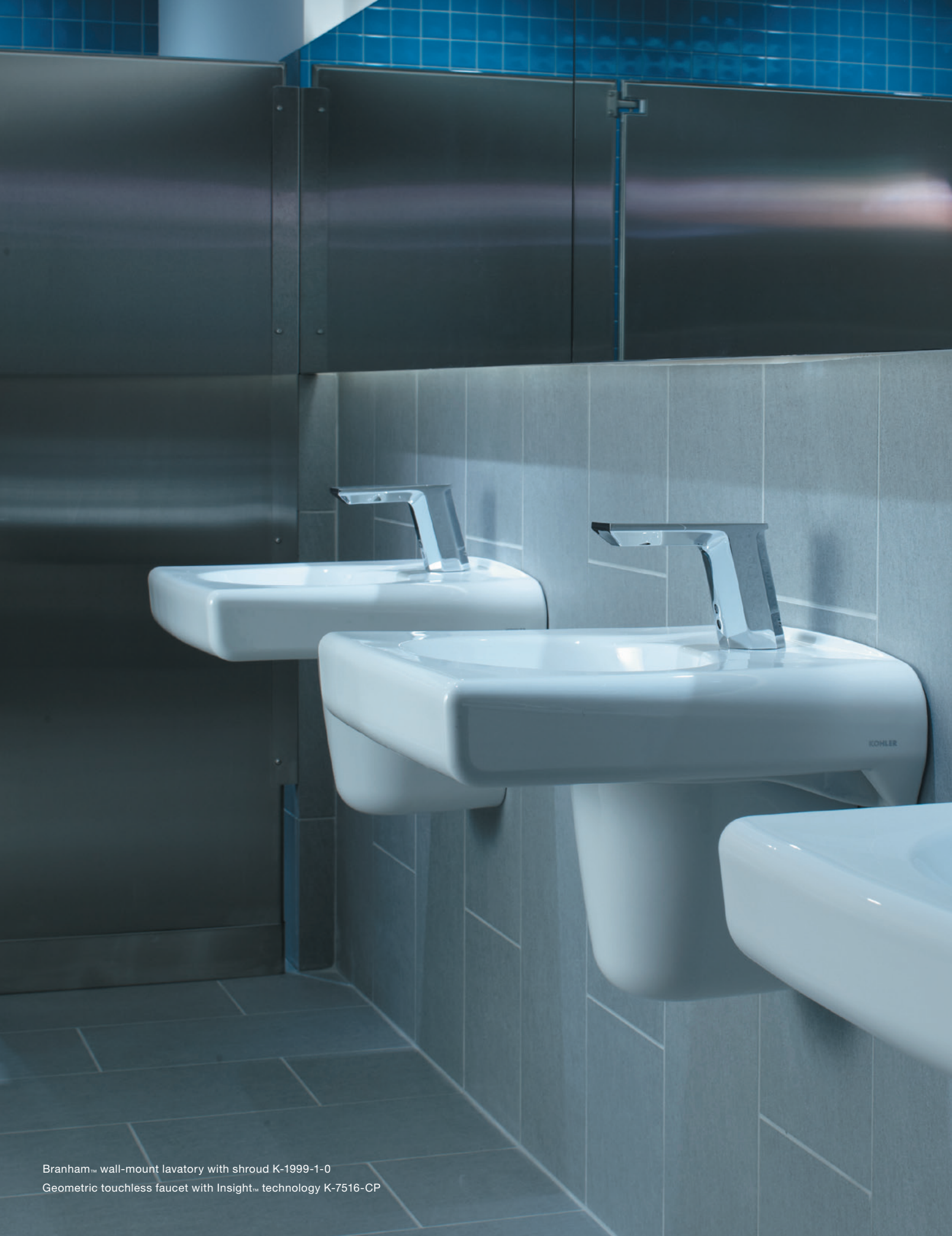
Branham™ wall-mount lavatory with shroud K-1999-1-0 Geometric touchless faucet with Insight™ technology K-7516-CP