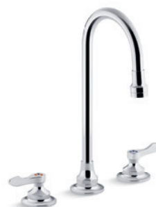
Widespread lavatory faucet with gooseneck spout and lever handles

0.5 gpm aerated K-800T20-5ANA 0.5 gpm laminar K-800T20-5ANL 1.0 gpm aerated K-800T20-5AKA 1.0 gpm laminar K-800T20-5AKL