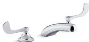
Widespread lavatory faucet with low spout and wristblade handles

0.5 gpm aerated K-800T20-4ANA 0.5 gpm laminar K-800T20-4ANL 1.0 gpm aerated K-800T20-4AKA 1.0 gpm laminar K-800T20-4AKL