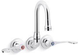
Shelf-back lavatory faucet with gooseneck spout, wristblade handles and grid drain