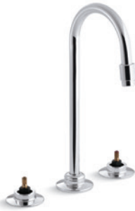
Widespread lavatory faucet base with gooseneck spout