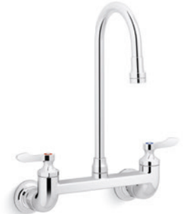
Wall-mount faucet with gooseneck spout and lever handles