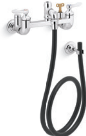
Wall-mount faucet with pail hook, vacuum breaker, threaded spout, hose, wall hook, lever handles and loose-key stops