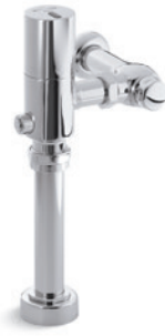
WAVE touchless toilet flushometer