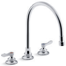
Kitchen sink faucet with gooseneck spout and lever handles

1.5 gpm aerated K-810T71-5AHA 1.8 gpm aerated K-810T71-5AFA