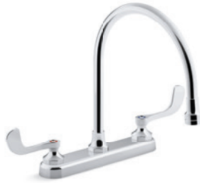
Kitchen sink faucet with gooseneck spout and wristblade handles

1.5 gpm aerated K-810T70-4AHA 1.8 gpm aerated K-810T70-4AFA