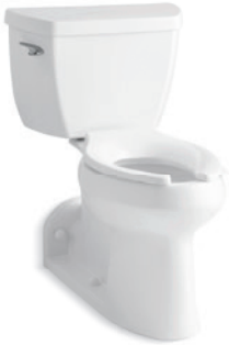
Barrington™ Comfort Height Elongated with rear outlet and Pressure Lite technology