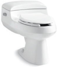
San Raphael® Comfort Height® One-piece elongated with Pressure Lite® technology and open-front seat