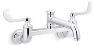
Wall-mount faucet with swing spout and wristblade handles