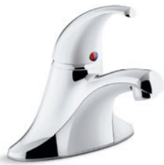
Coralais single-handle centerset lavatory faucet

Without drain With grid drain With pop-up drain