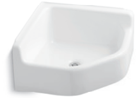
Whitby™ Floor-mount corner service sink

3' with two faucet drillings (shown) K-3200 4' with two faucet drillings K-3202 5' with three faucet drillings K-3203