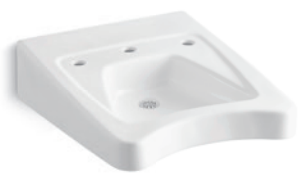
Chesapeake Wall-mount lavatory