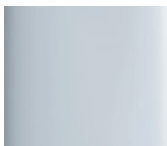
Polished Chrome (CP)