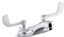
Centerset lavatory faucet with low spout and wristblade handles

0.5 gpm aerated K-400T20-4ANA 0.5 gpm laminar K-400T20-4ANL 1.0 gpm aerated K-400T20-4AKA 1.0 gpm laminar K-400T20-4AKL