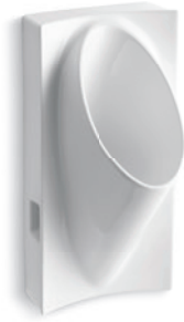
Steward Wall-mount waterless urinal