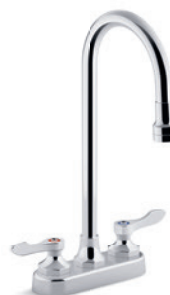
Centerset lavatory faucet with gooseneck spout and lever handles

0.5 gpm aerated K-400T20-5ANA 0.5 gpm laminar K-400T20-5ANL 1.0 gpm aerated K-400T20-5AKA 1.0 gpm laminar K-400T20-5AKL