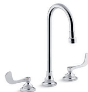
Widespread lavatory faucet with gooseneck spout and wristblade handles

0.5 gpm aerated K-800T70-4ANA 0.5 gpm laminar K-800T70-4ANL 1.0 gpm aerated K-800T70-4AKA 1.0 gpm laminar K-800T70-4AKL