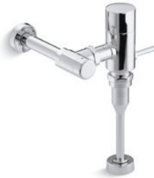
Primme manual urinal flushometer