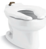
Primary™ Elongated with open-front seat; sized for prekindergarten applications

1.6 gpf top spud (shown) K-4388 1.6 gpf rear spud K-4398