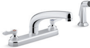
Kitchen sink faucet with low spout, lever handles and sidespray

1.5 gpm aerated K-810T20-5AHA 1.8 gpm aerated K-810T20-5AFA