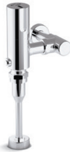
WAVE touchless urinal flushometer

K-7546/K-10949-SV K-7537/K-10958-SV K-7539/K-7542/K-10960-SV