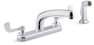
Kitchen sink faucet with low spout, wristblade handles and sidespray

1.5 gpm aerated K-810T21-4AHA 1.8 gpm aerated K-810T21-4AFA