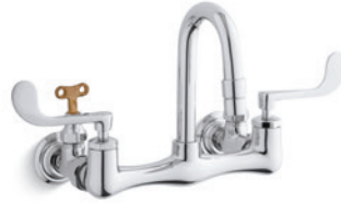
Triton lavatory faucet with wristblade handles and loose-key stops