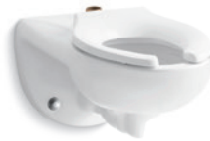
Kingston™ Ultra Elongated

1.1–1.6 gpf top spud (shown) K-84325 1.1–1.6 gpf rear spud K-84323