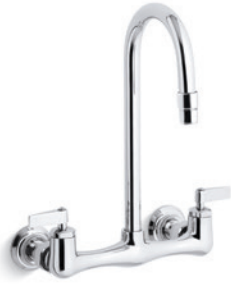
Triton sink faucet with lever handles